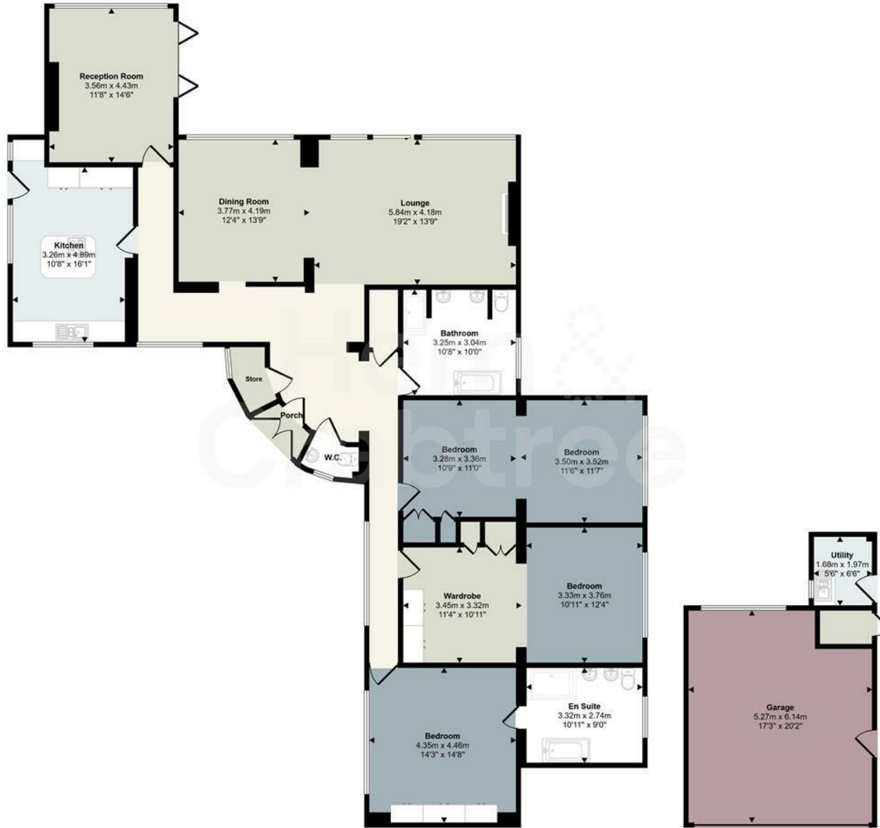
Floorplan Approx 207 sq m / 2228 sq ft